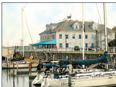
BUFFALO YACHT CLUB