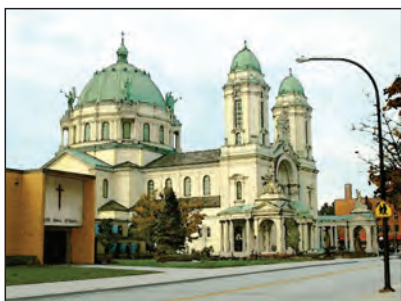
OUR LADY OF VICTORY